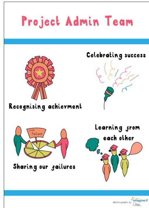
Background B - borders